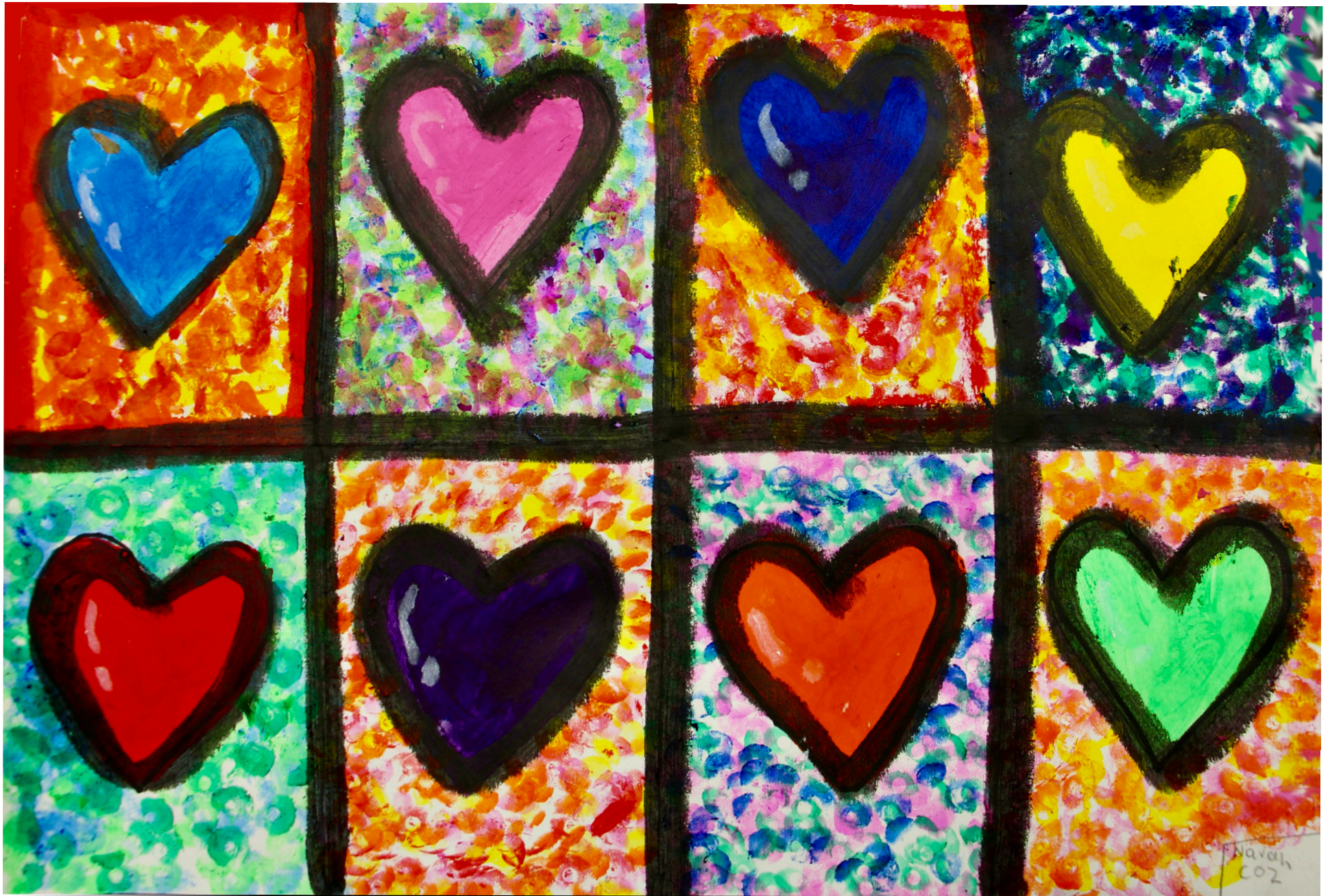
Navah Katayev, Grade 2 East Hills