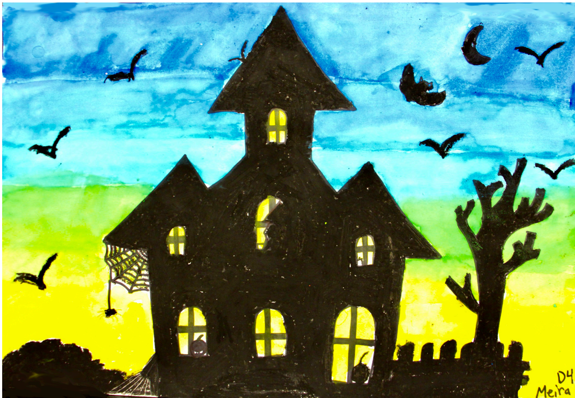
Meira Tubian, Grade 4 East Hills