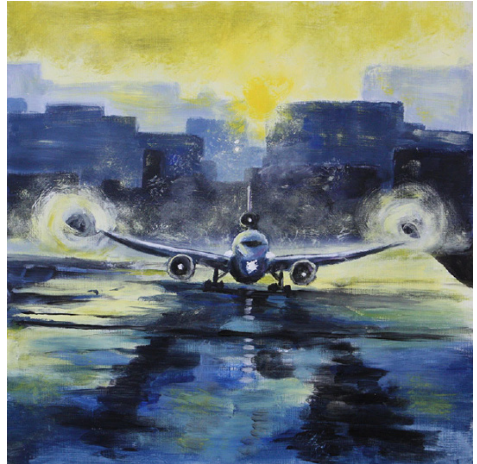
Audrey Vidal, RHS '19