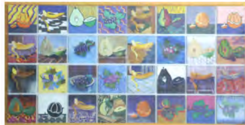
Untitled Mural Bojya High School, California

For a color version of this calendar: www.coltschools.org